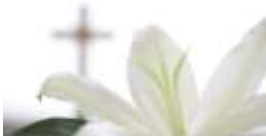
Easter - April 4, 2010

The Power of Commitment - It's All About You!